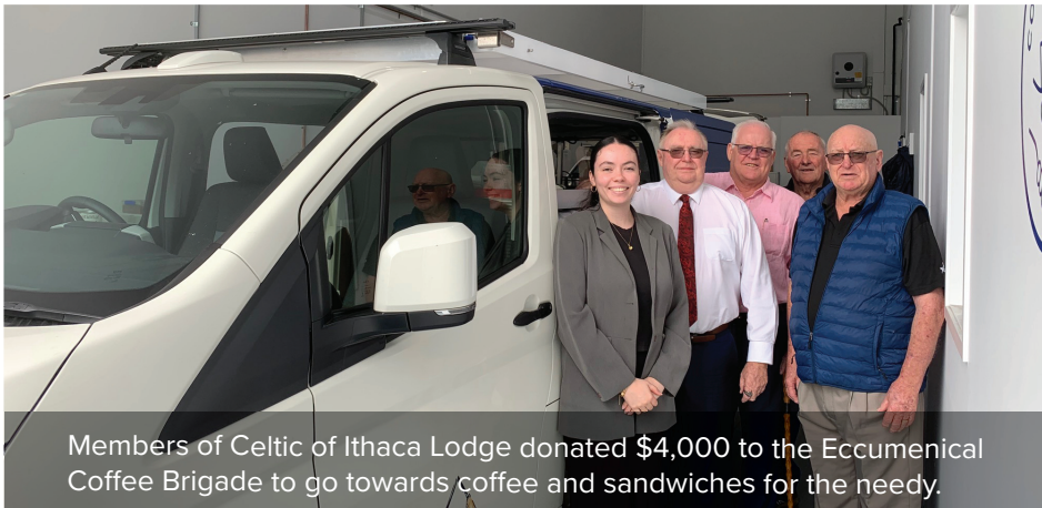
Members of Celtic of Ithaca Lodge donated $4,000 to the Eccumenical Coffee Brigade to go towards coffee and sandwiches for the needy.

Endeavour and Bentley Park Lodges have donated a total of $40,000 to the Couch Wellness Centre throughout the year, thanks to Lodge and individual donations and double matching from Hand Heart Pocket. The Centre provides holistic cancer care for people in Far North Queensland, allowing them to remain close to their loved ones while receiving care.