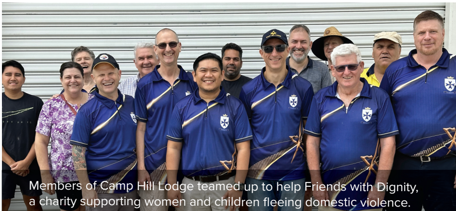
Members of Camp Hill Lodge teamed up to help Friends with Dignity, a charity supporting women and children fleeing domestic violence.

Celtic of Ithaca Lodge donated $4,000 to the Eccumenical Coffee Brigade with matching from Hand Heart Pocket. The funds are for supplies of coffee and sandwiches that are distributed to community members experiencing hardship. They have 300 volunteers who take turns to make the sandwiches and operate the van every morning. Since 1970 they have distributed over 3 million cups of coffee.