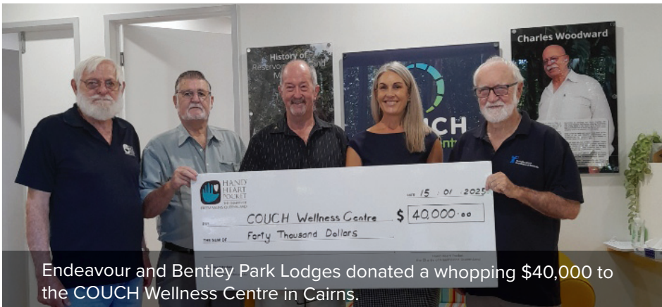
Endeavour and Bentley Park Lodges donated a whopping $40,000 to the COUCH Wellness Centre in Cairns.

Endeavour and Bentley Park Lodges have donated a total of $40,000 to the Couch Wellness Centre throughout the year, thanks to Lodge and individual donations and double matching from Hand Heart Pocket. The Centre provides holistic cancer care for people in Far North Queensland, allowing them to remain close to their loved ones while receiving care.