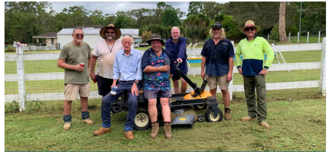
Above: The "Tibro-garden" gang joined forces to help In the Paws of Angels

JS Popham Conclave Members presented a $600 cheque to the Brighter Lives Townsville Hospital Foundation for their annual Christmas appeal.