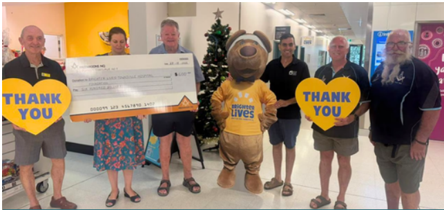
Above: Members of JS Popham Conclave donated $600 to Brighter Lives Townsville Hospital Foundation

JS Popham Conclave Members presented a $600 cheque to the Brighter Lives Townsville Hospital Foundation for their annual Christmas appeal.